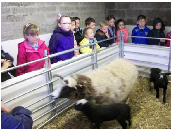
Study at Tamnamore Farm