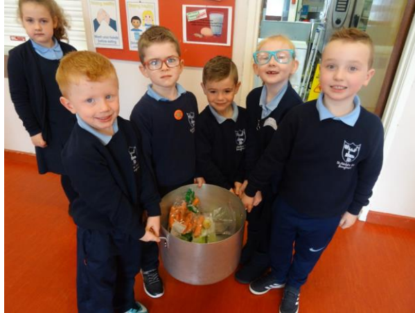
Primary 2 making soup!!