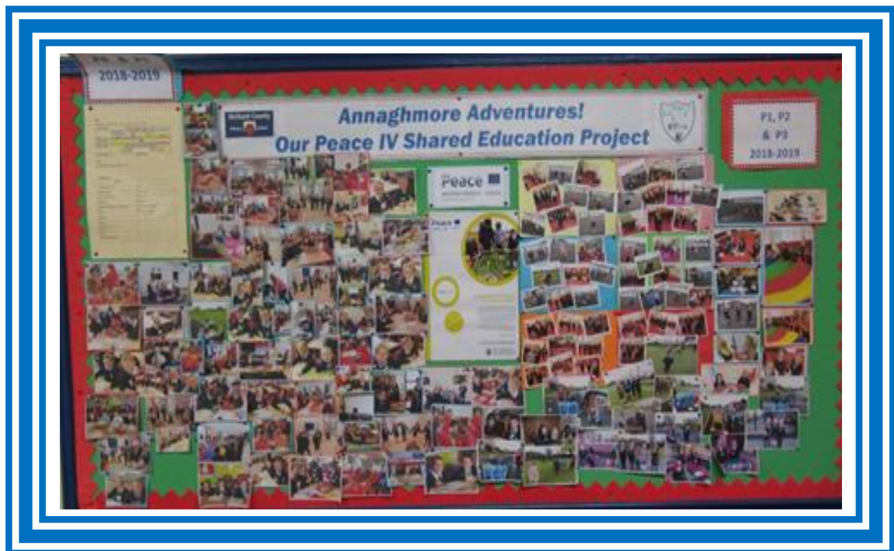
Whole school programme with Peace IV Shared Education.

We will ensure St. Patrick's PS makes a difference."