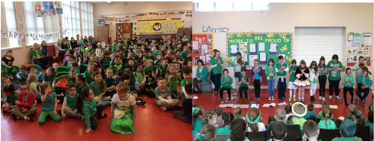
Green Day Celebrations