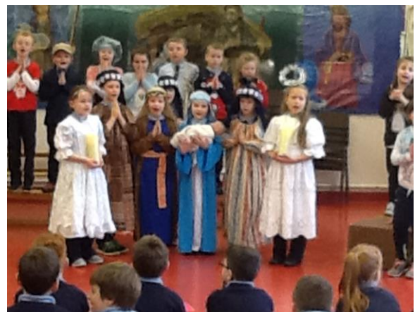
P1 Nativity Production