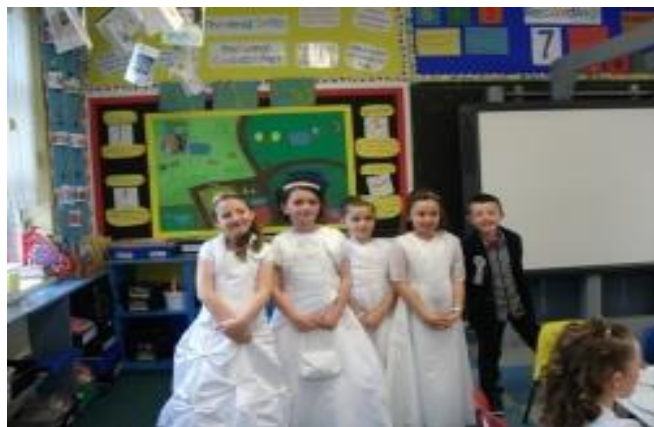
First Holy Communicants At the school reception