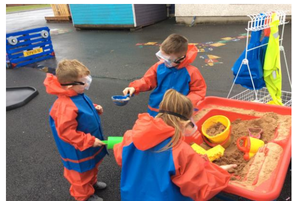
Primary 1 pupils enjoying outdoor play activities.