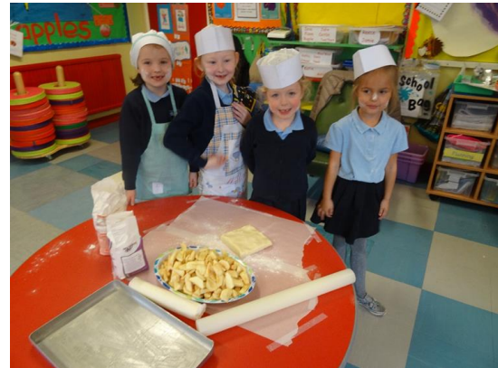
Primary 2 studying Healthy Eating.