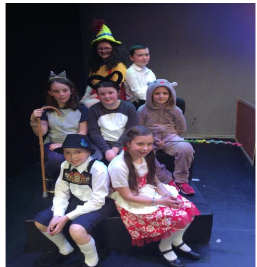
Whole School Production " Musicals Through the Years! "