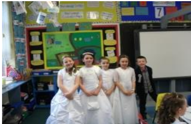
First Holy Communicants At the school reception