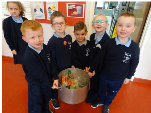
Primary 2 making soup!!

Every child is expected to be on time for school. The habit of punctuality must be acquired, and it is something that will stay with the child throughout their life. The co-operation of parents in this area is much appreciated. Class starts at 9:10am for all.