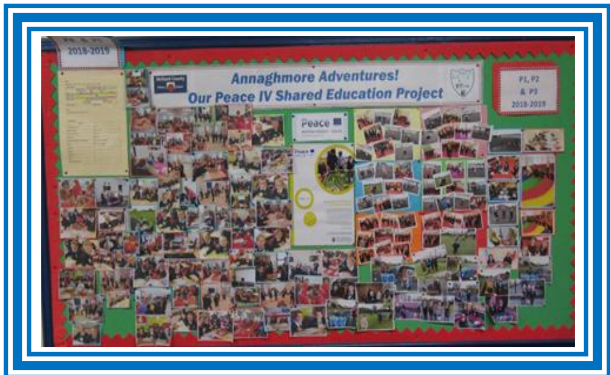
Whole school programme with Peace IV Shared Education.

We will ensure St. Patrick's PS makes a difference."