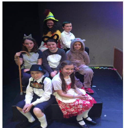
Whole School Production " Musicals Through the Years! "