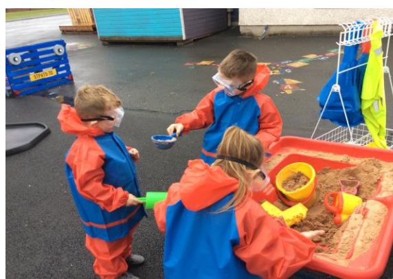
Primary 1 pupils enjoying outdoor play activities.