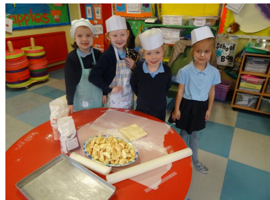
Primary 2 studying Healthy Eating.